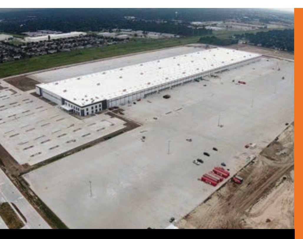
The largest OptiPave project at it's time of completion, a high performance OptiPave design reduces the amount of concrete needed.

Year of project completion using OptiPave: 2021